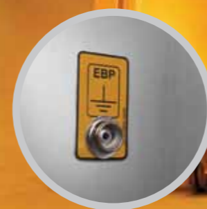
ESD GROUNDING POINT