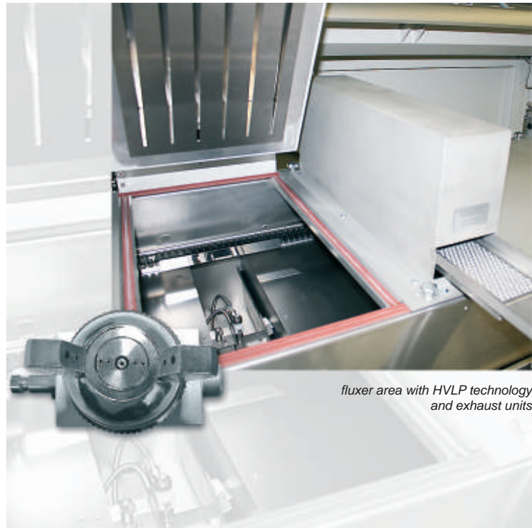
fluxer area with HVL technology and exhaust units

This is accomplished with the innovative tunnel concept, individually in speed controllable conveyor segments, the reproducible flux application, the modular preheat configuration and the up-to-date soldering area which leaves nothing to be desired.