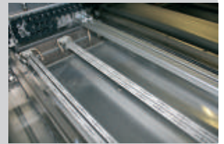
quartz preheat zone