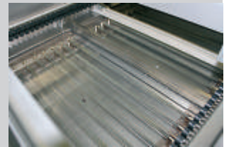
infrared preheat zone