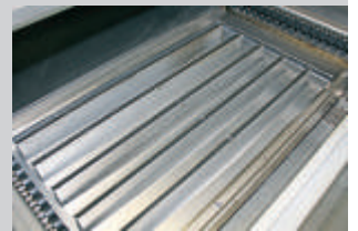
convection preheat zone