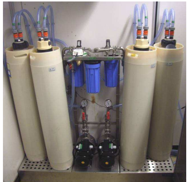
- DI water regeneration unit in option -