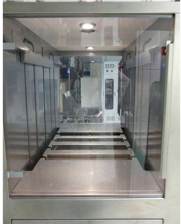
- Automatic Transfer System -