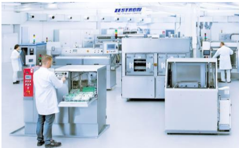
Machine Test Center