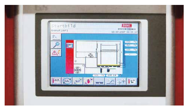
Operational Panel (Colour-Touch-Screen)

The machine's controller unit is located in an integrated control case and comprises switch, control, regulator and safety/fuse elements for all function units. The process is controlled and monitored with a failure message system via microcontroller with colour-touch-screen and intelligent operational panel.