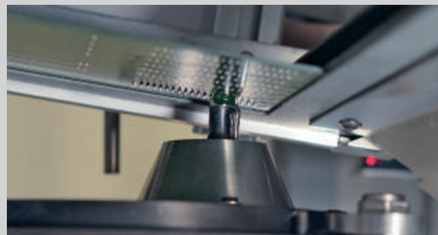
maintenance-free and wear-free nozzles ensure perfect results

The spray jet monitoring in the fluxing area, automatic wave height control, solder level monitoring with automated solder wire supply or nitrogen flow quantity control are only some of the monitoring functions that ensure precise, high quality soldering results.