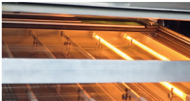
up-to-date pulsar bottom-side heating

Another highlight is the optimized soldering area with non-