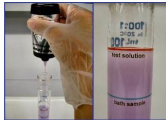
2) Adding test solution