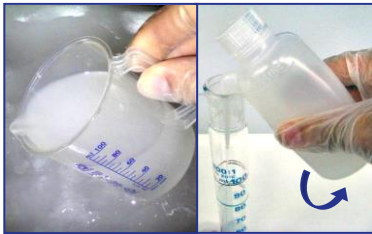
1) Sampling / Decanting