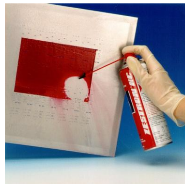
Cleaning of adhesives on stencils with ZESTRON® HC