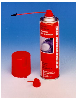
ZESTRON® HC aerosol can

Please refer to the material compatibility list (Technical information 3) before cleaning plastics.